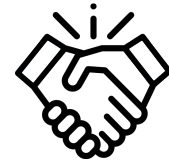
Relationship Building and Dispute Resolution

The TSS Committee will be accepting applications from December 2, 2024, to April 30, 2025.