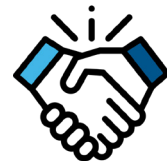
Relationship Building and Dispute Resolution

The TSS Committee will be accepting applications from April 2, 2024, to June 7, 2024.