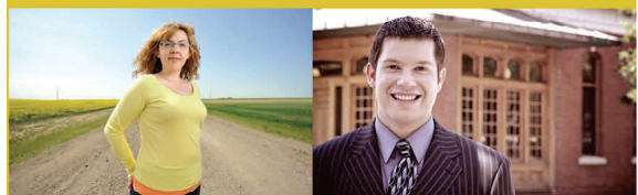
Local Government Authority Certificate

Realize. Local government as big opportunities.