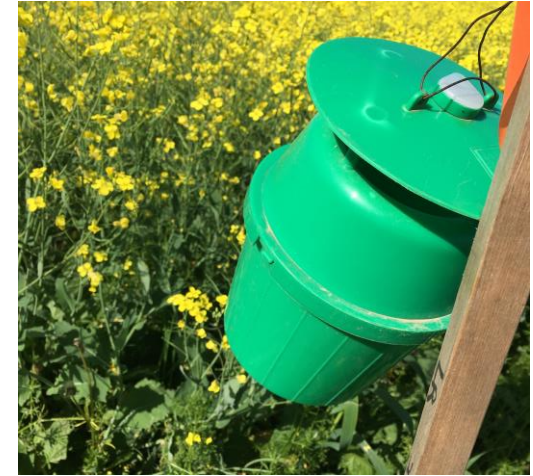
Bertha Armyworm Moth Trap