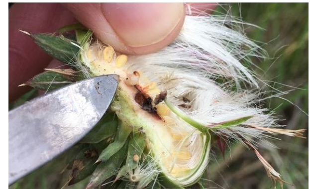
Nodding Thistle Biocontrol