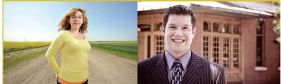
Local Government Authority Certificate

Realize. Local government as big opportunities.