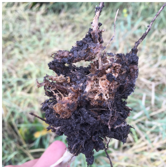
Decomposing clubroot gall

Infected roots will eventually disintegrate, releasing resting spores into the soil, which may then be transported by wind, water erosion, animals/manure, shoes/clothing, vehicles/tires, or earth tag on agricultural or industrial field equipment. The clubroot pathogen, in the form of resting spores in the soil, can be moved any way that soil can be moved. Activities that move large volumes of soil (such as on agricultural or industrial field equipment) between areas or regions are considered to have the highest risk.