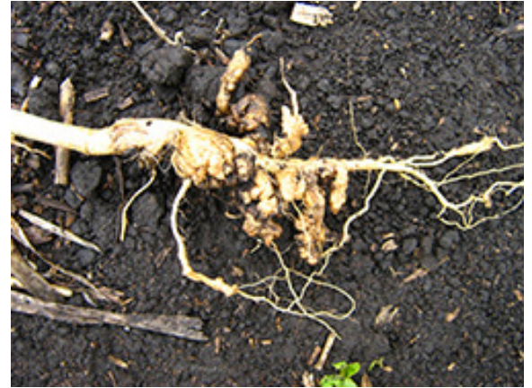
Clubroot infected canola root with intact clubroot galls

Clubroot is a soil-borne disease caused by a microbe, Plasmodiophora brassicae ( P. brassicae ). Clubroot affects the roots of host plants, which include cruciferous field crops such as canola, mustard, camelina, oilseed radish and taramira, and cruciferous vegetables such as arugula, broccoli, Brussels sprouts, cabbage, cauliflower, Chinese cabbage, kale, kohlrabi, radish, rutabaga and turnip. Cruciferous weeds (e.g. stinkweed, shepherd's purse, wild mustard) can also serve as hosts for the clubroot pathogen.